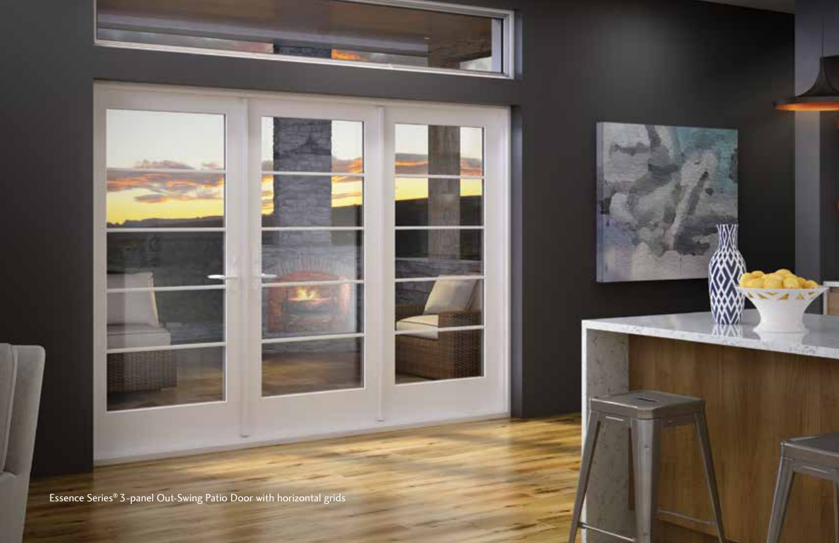
Essence Series® 3-panel Out-Swing Patio Door with horizontal grids