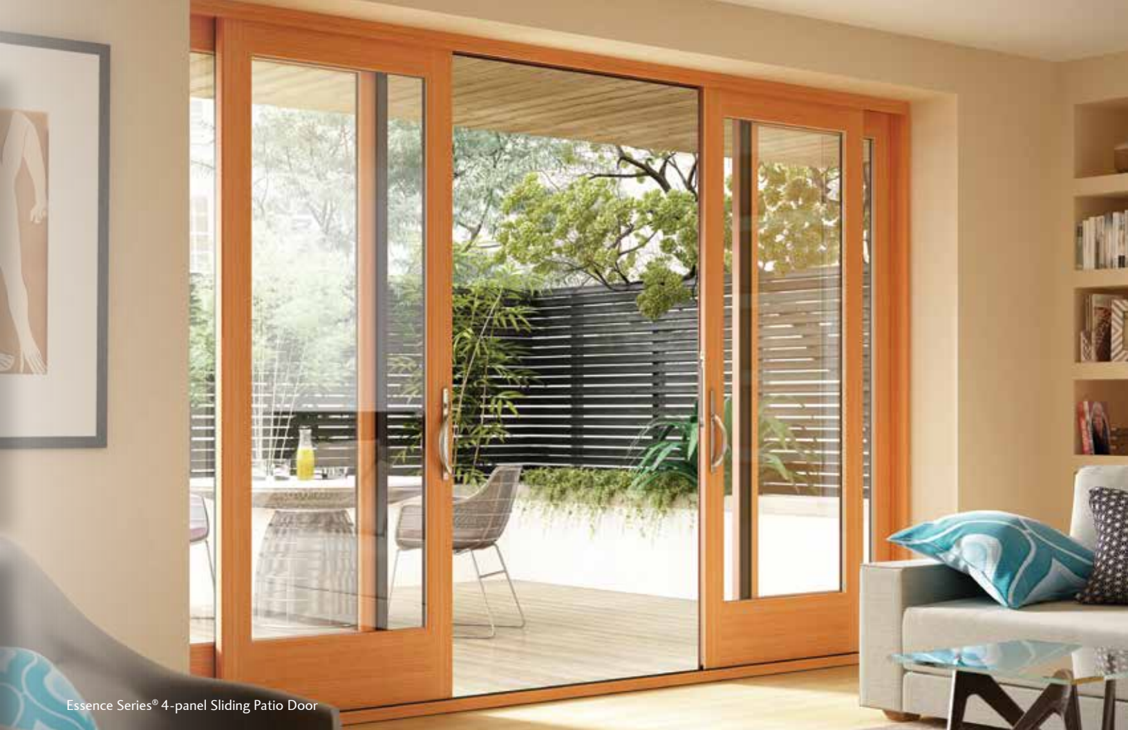
Essence Series® 4-panel Sliding Patio Door