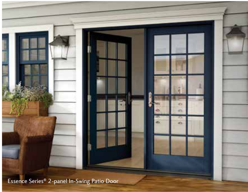
Essence Series® 2-panel In-Swing Patio Door