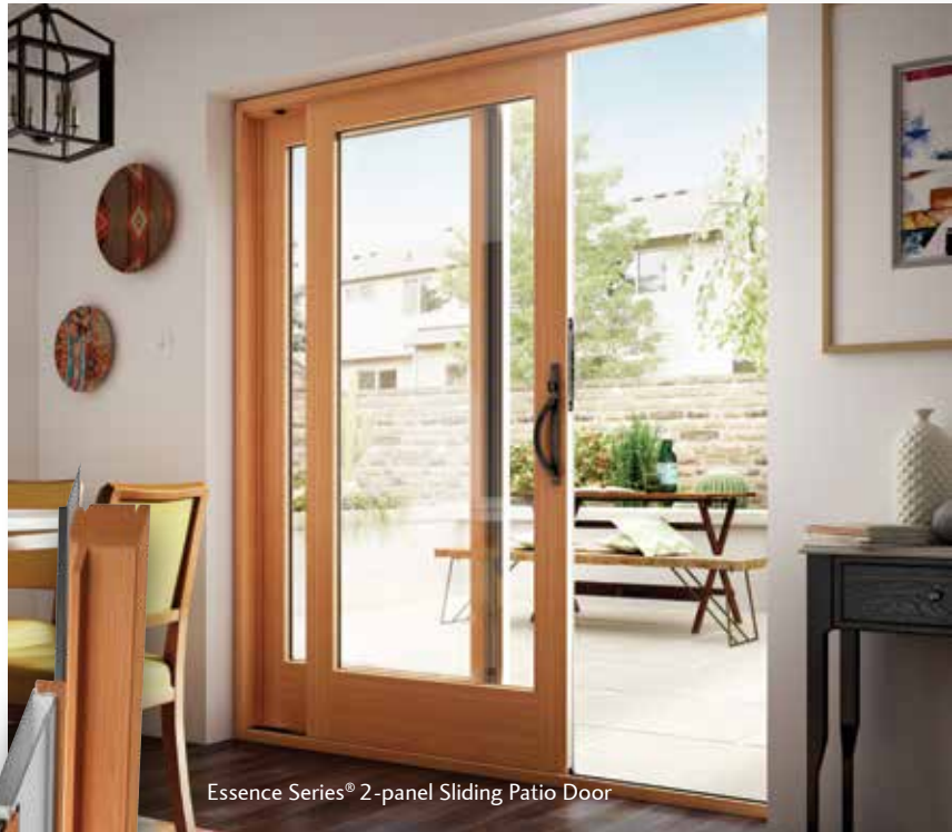
Essence Series® 2-panel Sliding Patio Door