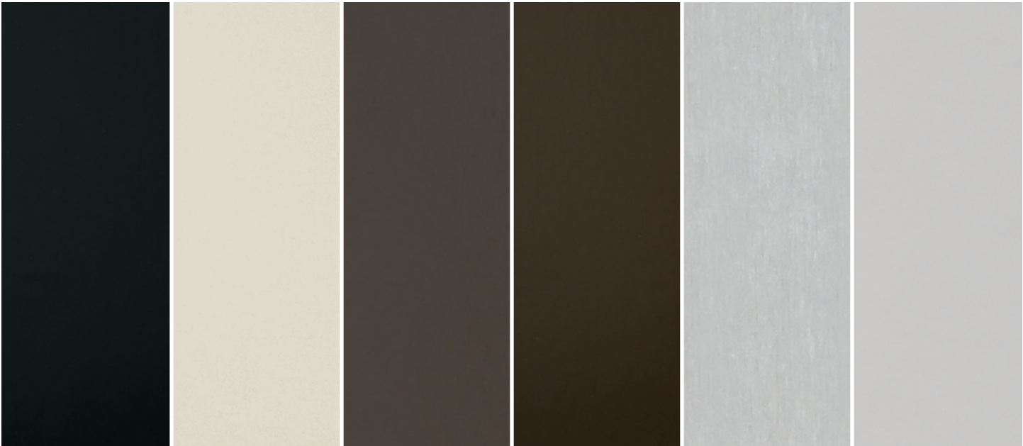
MATTE BLACK WHITE BRONZE* DARK BRONZE** SATIN CHROME POLISHED CHROME